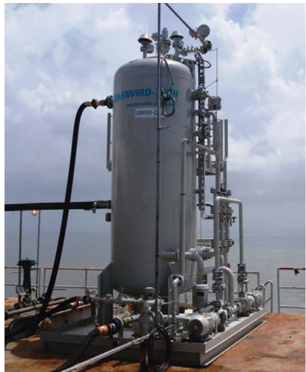
Enviro-Cell™ (EC-3V) Vertical Used in testing Process

Possessing similar attributes to the a Horizontal IGF, the Enviro-Cell (EC-3V)