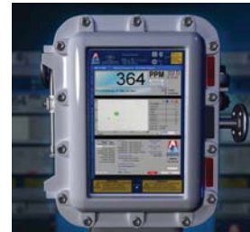
Advances Sensors OIW Analyzer

In order to validate the effectiveness of the Enviro-Cell (EC-3V) Vertical, sample points were selected at both the inlet, which was fed directly from the existing skimmer and the outlet, then discharged overboard. The samples were taken and tested periodically. Enviro-Tech Systems' Advanced Sensors Oil in Water Analyzer provides instant remote evaluation of overboard water quality by utilizing UV fluorescence, spectroscopy, microscopy, or for samples taken inline. The unit also has a continuous online ultrasonic cleansing process for inline cleaning. Chemicals were used for enhanced oil/water separation.