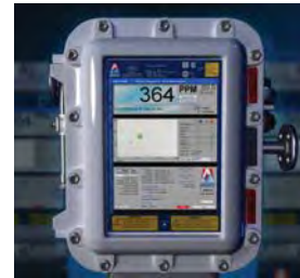
Advances Sensors OIW Analyzer

In order to validate the effectiveness of the Enviro-Cell (EC-3V) Vertical, sample points were selected at both the inlet, which was fed directly from the existing skimmer and the outlet, then discharged overboard. The samples were taken and tested periodically. Enviro-Tech Systems' Advanced Sensors Oil in Water Analyzer provides instant remote evaluation of overboard water quality by utilizing UV fluorescence, spectroscopy, microscopy, or for samples taken inline. The unit also has a continuous online ultrasonic cleansing process for inline cleaning. Chemicals were used for enhanced oil/water separation.